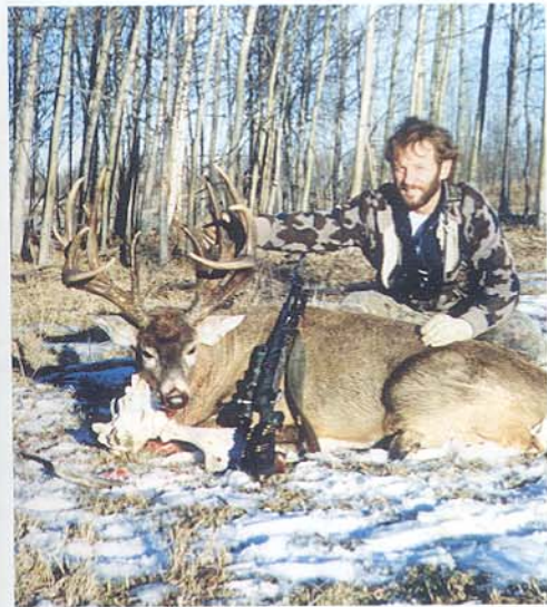
The Boland Buck

If you take the time to really study the trophy books, like Boone and Crockett and the Alberta Fish and Game Association's Alberta Wildlife Records, you'll see a pattern begin to emerge. While undoubtedly some of the success in these hot spots has to do with the number of hunters hunting a certain region, I think there is more to it. Certain areas of the